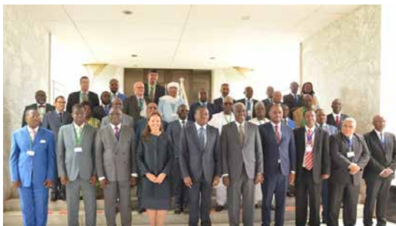
The SAATM Champion – H.E. Faure Gnassingbe, President of Togo and other delegates at the fourth Ministerial Working Group (MWG) on SAATM held between 25th - 28th May, 2018 in Lome, Togo