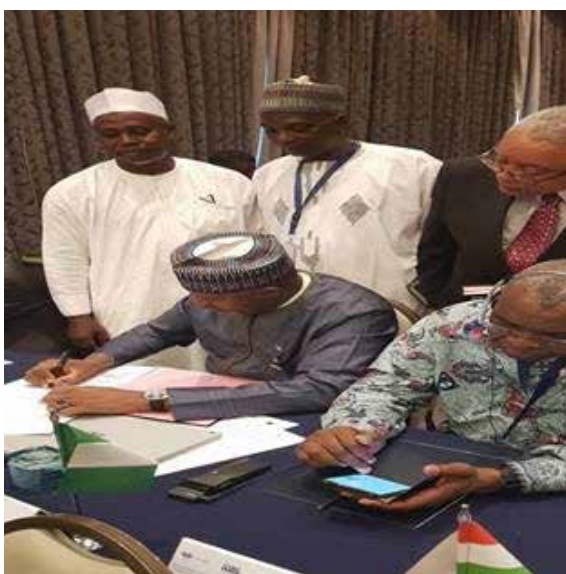
• The Minister of Nigeria (left) and the Minister of Burkina (right) signing the Memorandum of Implementation