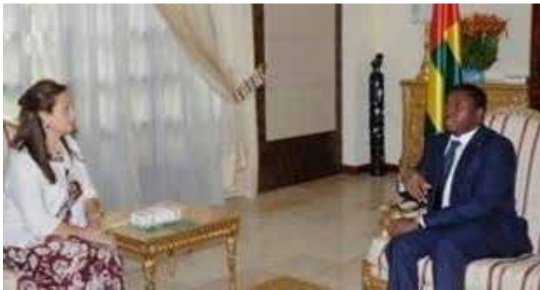
• The AUC team lead by the Commissioner of Infrastructure of AUC also met H.E, President of TOGO with the team of AFCAC to discuss issues related to the Status of implementation of the SAATM.