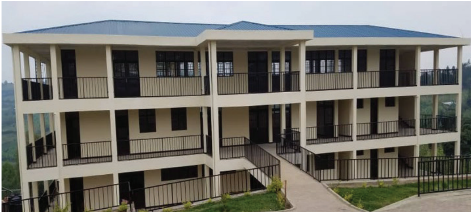
Ngarama VTC complex completed and under usage