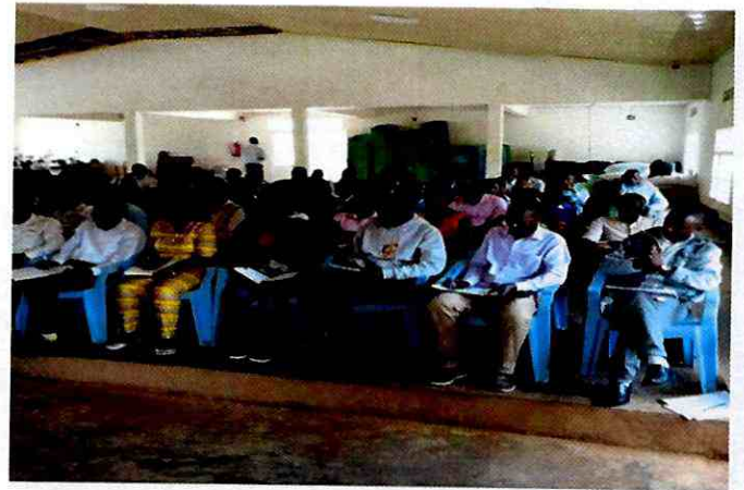
Umuyobozi w'Inama Ngishwanama atangiza inama