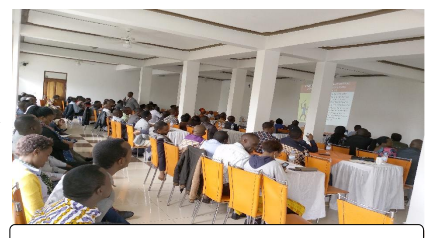
Trainina on Noza Imibanire mu Murvanao in the Southern Province

"Noza Imibanire mu Muryango wawe" training module developed in 2015, was revised in 2019, to integrate the amended laws and the Government's new family promotion related programmes. The later were designed to address the issues of family conflicts, different forms of violence, murder, prostitution, and