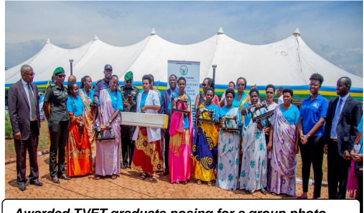
Awarded TVET graduate posing for a group photo

The Ministry of Gender and Family Promotion in partnership with different partners have been implementing Women and Youth Access to Finance Strategy (W&YA2F); adopted in 2012 and revised in 2016. The implementation of this strategy started in 2014, under National Employment Program (NEP) whereby Women and Youth are facilitated to access finance