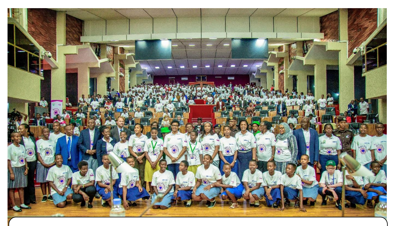
Launch of the Integrated Family Campaign coupled with G2Leader campaign & celebration of International Day of the Girl Child, 11th October 2018, at parliament premises

The Government of Rwanda through Social Cluster Ministries and their affiliated institutions, Development partners and Non-Government Organizations conducted a nationwide awareness Campaign on Governance and Family Welfare under the coordination of Ministry of Gender and Family Promotion from 11th October to 10th December 2018 in the purpose of creating a bigger impact to the family welfare.