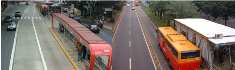
Figure 6-1: Typical BRT systems with bus ways in the median of the roadways (as proposed for Kigali City)

However, the final routes and detailed design for the BRT system will be finalized after the completion of the on-going study on public transport.