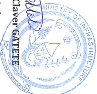
Hon. Amb. Claver GATETE Minister of Infrastructure

A handwritten signature in blue ink, appearing to read 'Claver Gatete', written over a circular official stamp.