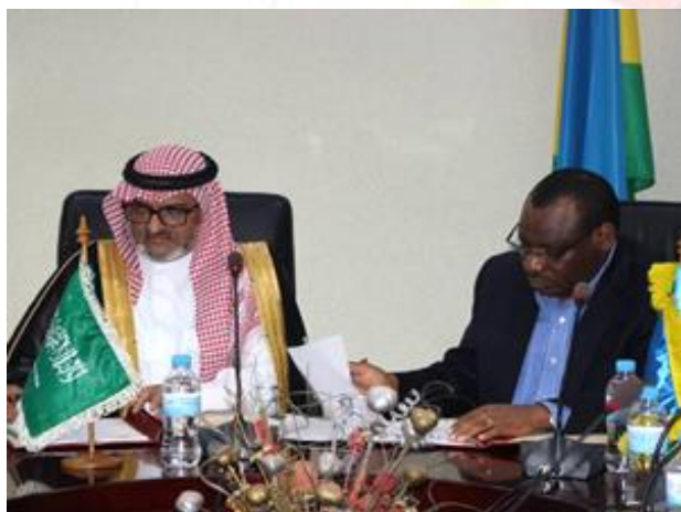
Fig 2: Signing Ceremony between MINECOFIN and Saudi Fund

The Government of Rwanda recognizes the importance of this fund's support as essential in the implementation of sustainable development goals (SDGs) which focus on infrastructure development and the project is expected to be completed by mid-2019.