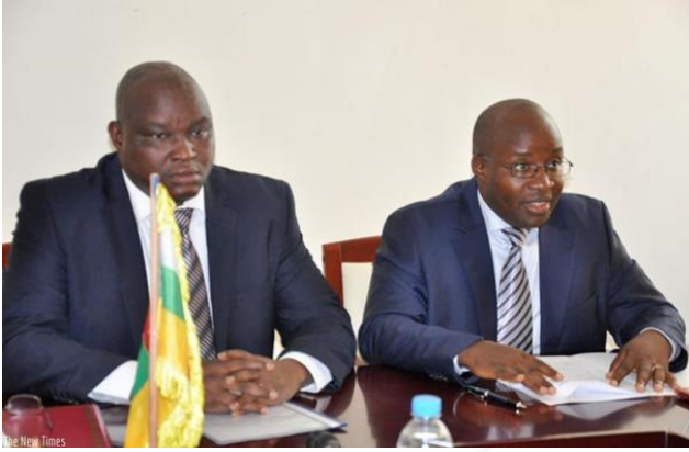
Figure: 5 Signing Ceremony

The agreement provides a business opportunity to strengthen our commercial aviation and make it more profitable for our people to trade and share experiences without any limitations.