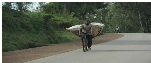
Fig 4: Existing Nyagatare – Rukomo Earth Road

Nyagatare– Rukomo road is an existing earth road of 73.3 kilometers length which is a segment of the Nyagatare-Rukomo-Byumba-Base 124.8 kilometer road.