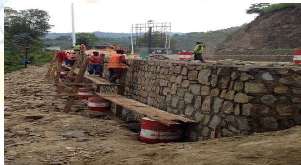
Fig 3: Construction of Retaining wall

Both Works and Supervision contracts were signed on 12th November, 2015 and the project implementation is on-going. Upon completion, the road will not only have significant impact by linking western to neighboring regions of the country but will also reduce the costs of transport and mobility in general, and improve the road security and safety as well as raise the standards of living of the population in the area. The road will further will lead to market access for agricultural production and is expected to increase employment opportunities and in general lead to poverty reduction.