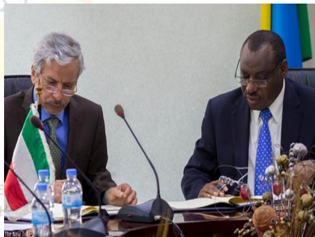
Figure 1: Signing ceremony between MINECOFIN and KFAED