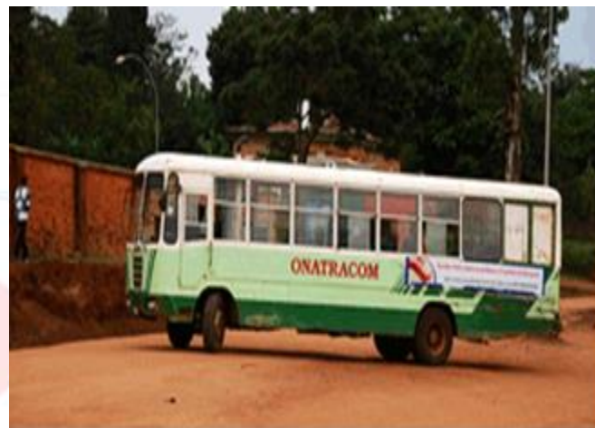
Fig 5: Existing ONATRACOM Bus

The new company will keep serving the primary mission of ONATRACOM which is to curb internal isolation of different regions of the country, with the aim of facilitating the population (especially in those in rural areas) in accessing not only developmental activities but also the socio-economic amenities (Hospital, public institutions, schools, churches, market, etc...) at an affordable price.