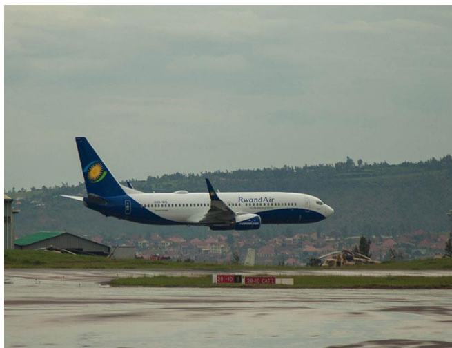
Boeing 737-800NG performs a low pass at the airport

On 28 September 2016, RwandAir acquired a new wide body Airbus A330-200 and becoming the launch operator of the type in East Africa. The carrier also has an A330-300 on order, which will also be delivered in November. The A330-200 is configured in a three-class cabin layout with 20 seats in business, 21 in premium economy and 203 seats in economy class.