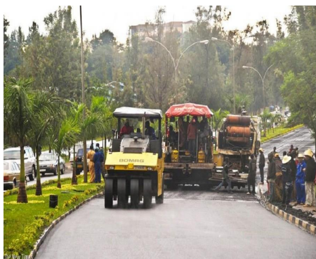
Road construction works expected soon in CoK

When complete, the project is largely expected to improve the traffic capacity of Kigali urban roads while easing and facilitating smooth transportation of passengers and goods.