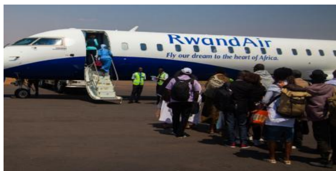
Passengers board a RwandAir plane heading to Cotonou at Kigali International Airport.

The business community hailed the national carrier's decision to fly to Benin saying it is an opportunity that will help promote trade and tourism between the two countries. The flights to Cotonou are currently tagged to the existing Kigali -Douala and Libreville, and are part of the strategy to enhance connectivity between East Africa and West Africa, the RwandAir senior manager in charge of grounds operations, said.