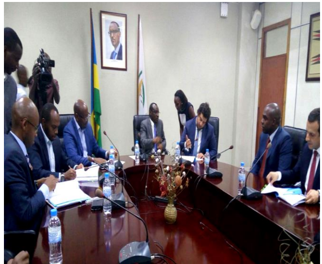
Finance Minister Amb. Claver Gatete and James Musoni Minister of Infrastructure represented the government at the signing ceremony

to boost the country's economic growth and development.