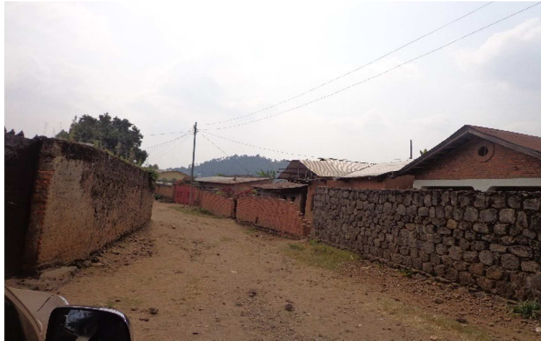
Figure 2: Some of the buildings that will be affected by the construction of the roads