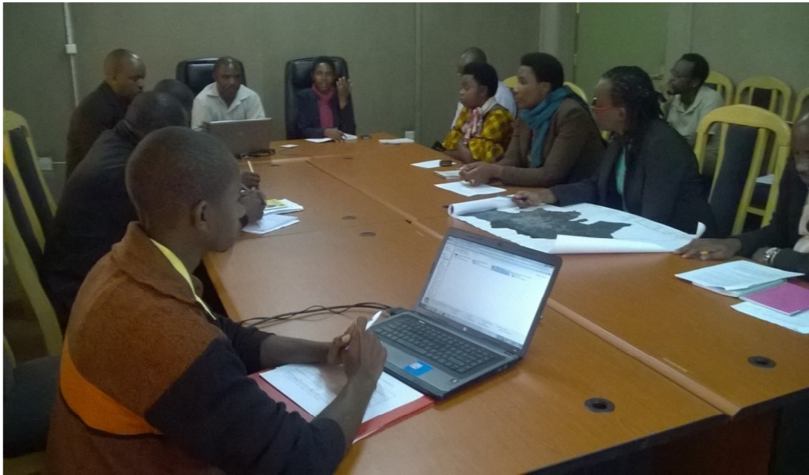
Figure 1: Consultation meeting in Musanze District