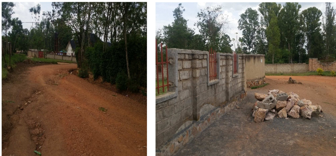
Figure 2: Some of the assets that will be affected during the implementation of the project

As in any projects funded by the World Bank, the principle of avoiding, minimizing and mitigating any likely adverse impact including involuntary resettlement was emphasized during the design stage of the project. In this perspective, an attempt has been made to avoid expropriation as much as possible as per the primary criteria of development scheme for Phase I selected investments in Nyagatare District. However, the impact on a few properties could not be avoided even after applying all necessary measures.