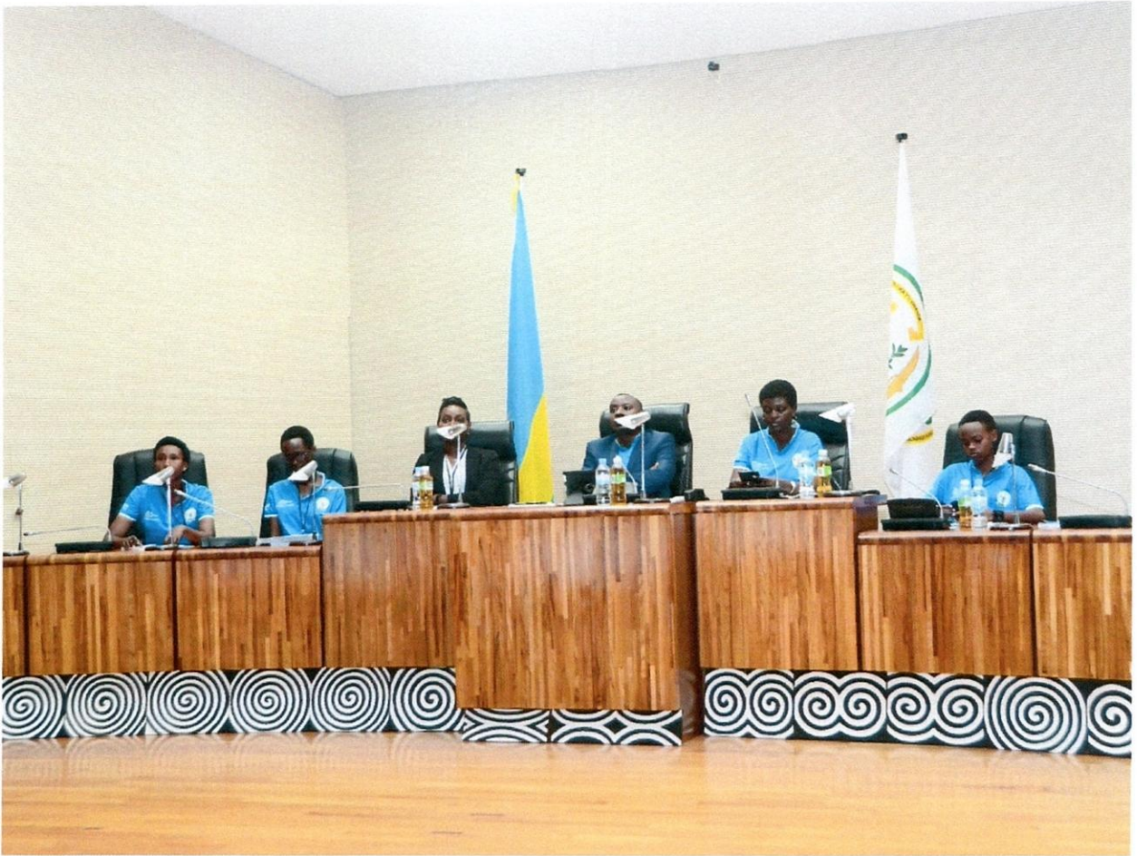
Abatanze ibiganiro mu Nama Nkuru y' Igihugu ya 12 y' Abana

Nk'uko bisanzwe bikorwa mu nama nkuru z'abana, Inama Nkuru ya 12 y'Abana yatanzwemo ibiganiro bitanu (5) bijyanye n'insanganyamatsiko y'Inama. Ibyo biganiro n'ababitanze bigaragara mu mbonerahamwe ikurikira: