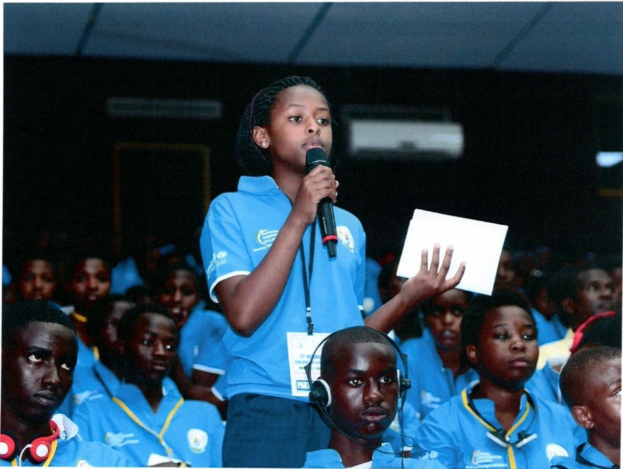
Umwana abaza ibibazo anatanga inama y' uko byakemurwa

Nk' uko bisanzwe, mu Nama Nkuru y' Igihugu y' Abana, hatangwa umwanya uhagije abana bakabaza uburyo ibibazo bikibangamira iyubahirizwa ry' uburenganzira bwabo mu Rwanda bikemurwa, hakanatangwa ibitekerezo by' uko byakemurwa neza kurushaho ndetse n' abayobozi bagasobanura icyerekezo cya Leta mu guteza imbere iyubahirizwa ry' uburenganzira bw' abana.