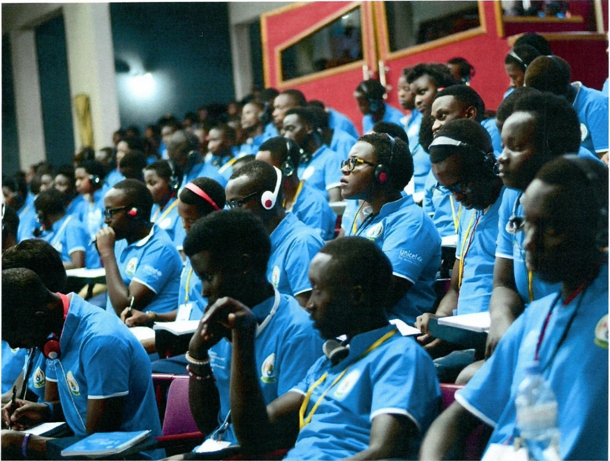
Abana mu Ngoro y' Inteko ishingira Amategeko