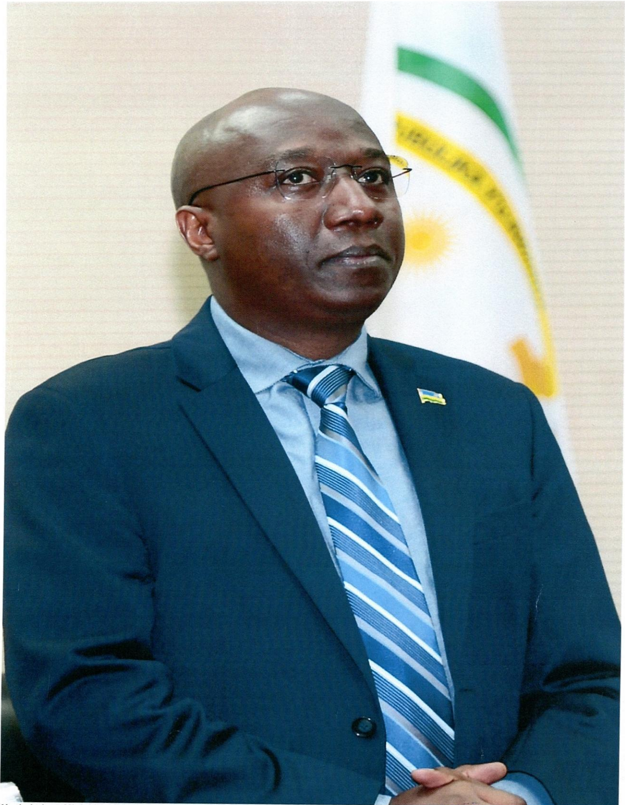
Nyakubahwa Minisitiri w' Intebe Dr. NGIRENTE Eduard