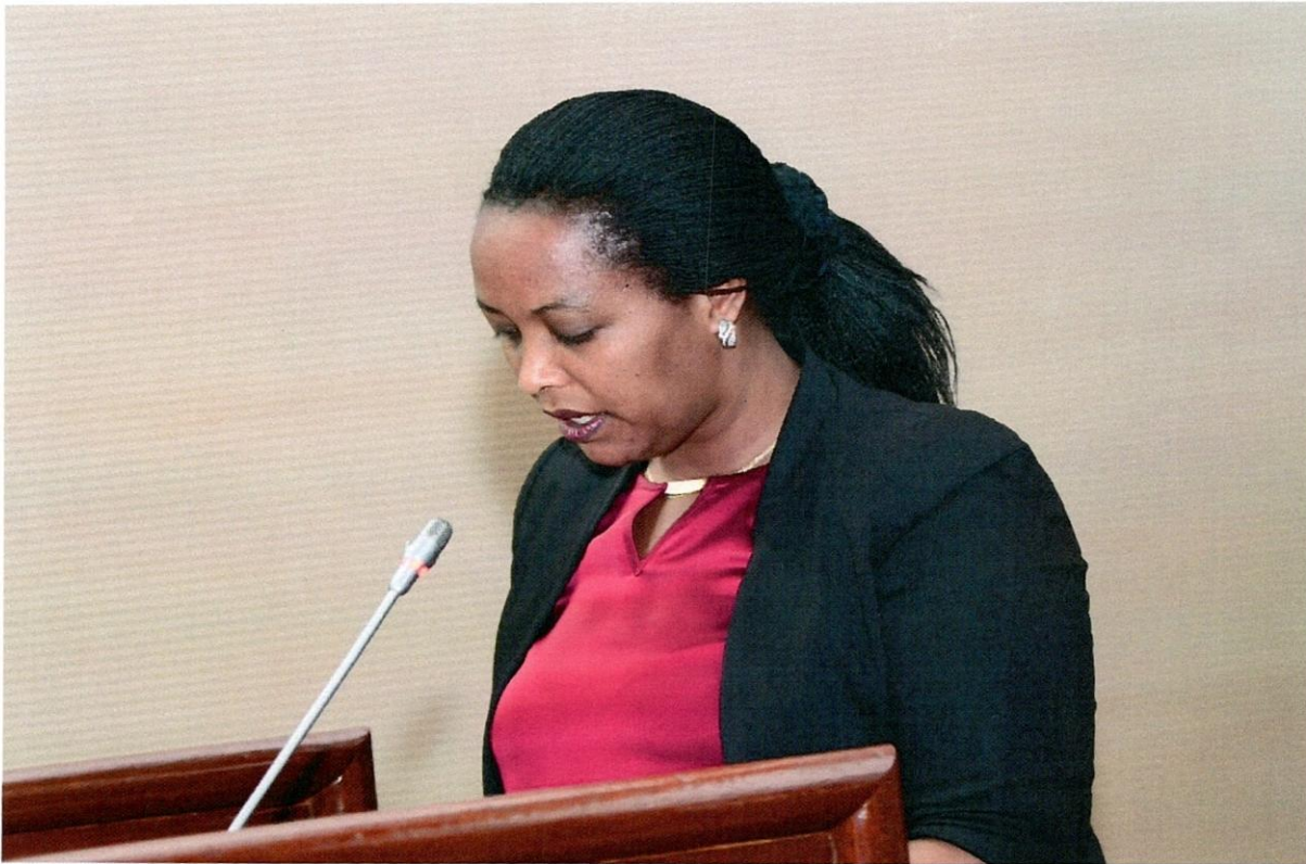
Nyakubahwa Minisitiri w'Uburinganire n'Iterambere ry'Umuryango, Madamu NYIRASAFARI Espérance

Nyakubahwa Minisitiri w' Uburinganire n' Iterambere ry' Umuryango unafite abana mu nshingano ze, yashimiye by' umwihariko Nyakubahwa Perezida wa Repubulika n' umufasha we, Madamu Jeannette KAGAME, nk' ababyeyi beza, baha umwanya munini n' agaciro abana b' Igihugu bigashimangirwa na gahunda nziza ziriho nko kuba buri mwaka batumira abana baturutse mu Gihugu hose bakabifuriza Noheri nziza gusoza umwaka no gutangira neza umwaka mushya anasaba ko ababyeyi bose babareberaho urwo rugero rwiza.