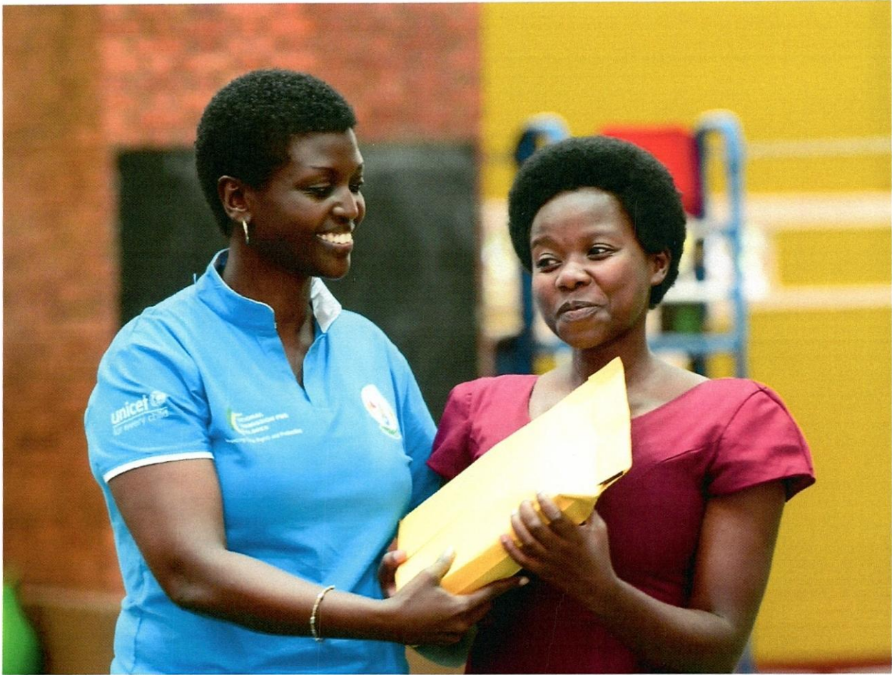
Umunyamabanga Nshingwabikorwa wa Komisiyo y' Igihugu ishinwe Abana ashyikiriza umunyamakuru igihembo