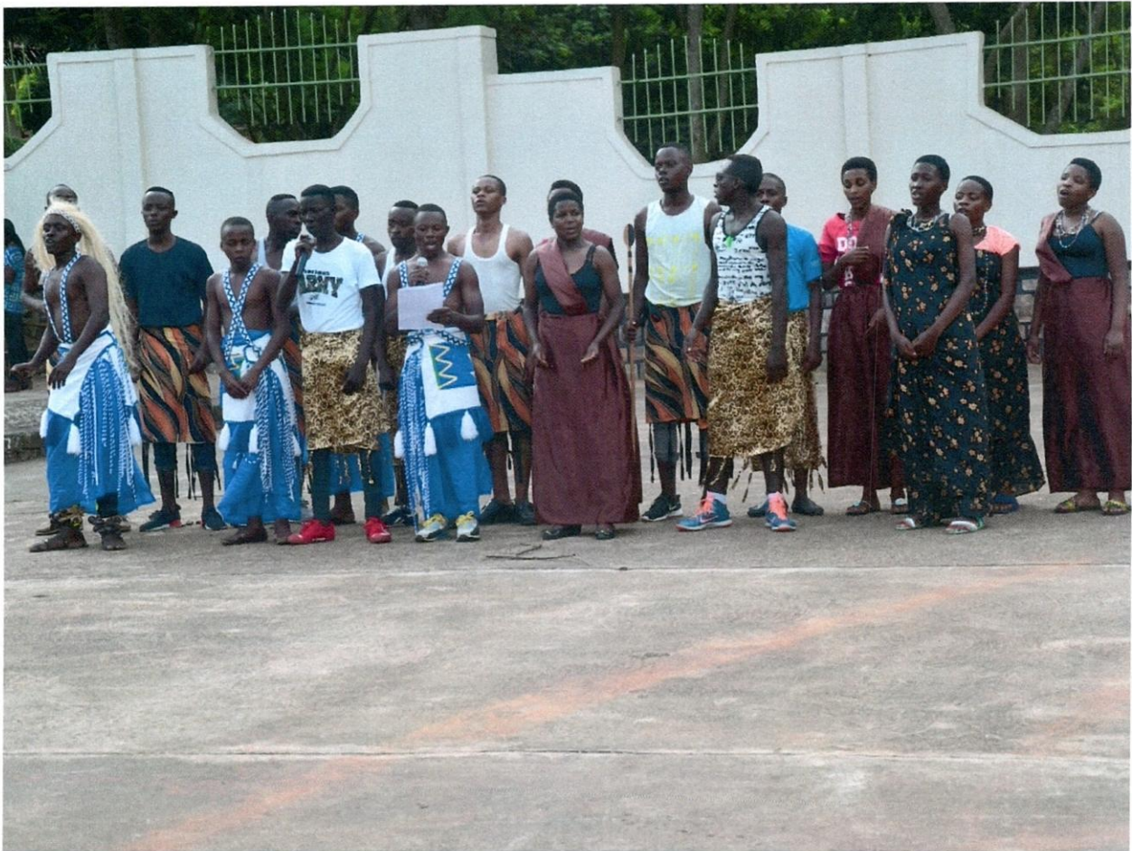
Abana bavuga umuvugo ku wa 06/12/2017

Mu gihe hategurwaga Inama Nkuru y' Igihugu ya 12 y' Abana, ku wa 06 Ukuboza 2017, abana bamuritse ibihangano bateguye mu gihe biteguraga kuzitabira inama nk' uko byari bikubiye mu byo baganirijweho mu gihe cy' inama zibanziriza Inama Nkuru y' Igihugu ya 12 y' Abana bigizwe n' imbyino, ikinamico n' imihimirizo byimakaza uburere buboneye nk' umusingi wo kubaka u Rwanda twifuzza nk' uko bikubiye mu nsanganyamatsiko y' inama.