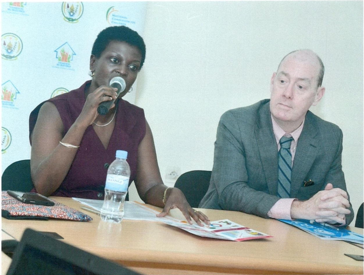
Ikiganiro n' abanyamakuru ku wa 05 Ukuboza 2017 mu cyumba cy' inama cya Croix- Rouge y' u Rwanda