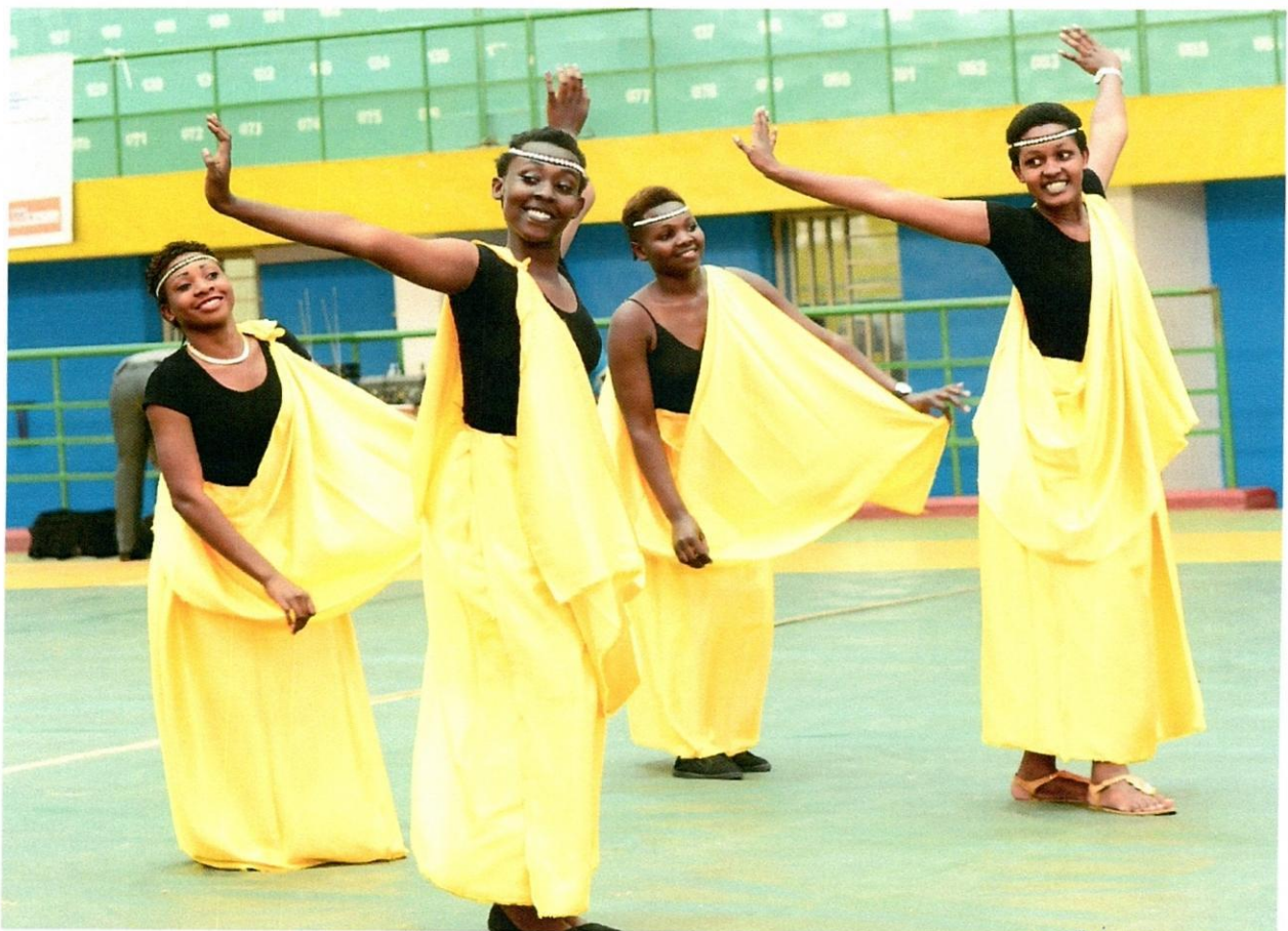
Abana bagaragaje imbyino nyarwanda zimakaza uburere buboneye mu muryango