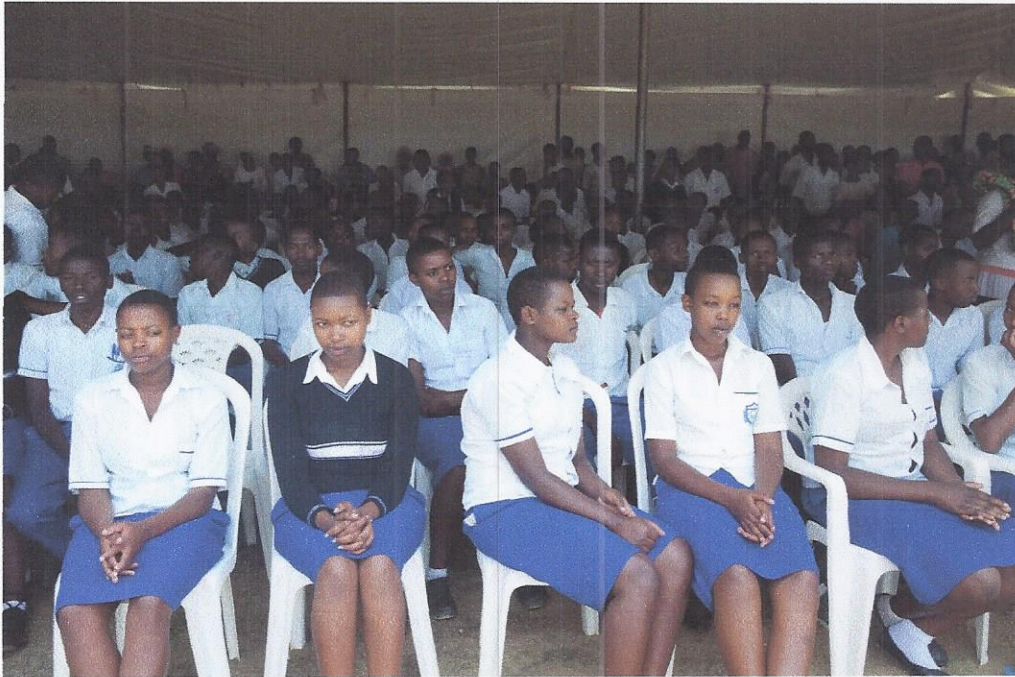
Ifoto 6: Abanyeshuri bitabiriye ibirori

Umunsi Mpuzamahanga w'Umwana w'Umukobwa usanzwe wizihizwa ku itariki ya 11 Ukwakira buri mwaka; uyu mwaka wizihijwe ku itariki ya 15/10/2016 mu Karere ka Nyaruguru mu Murenge wa Cyahinda uhuzwa n'Umunsi Mpuzamahanga w'Umugore wo mu cyaro n'ubukangurambaga bw'umuryango.