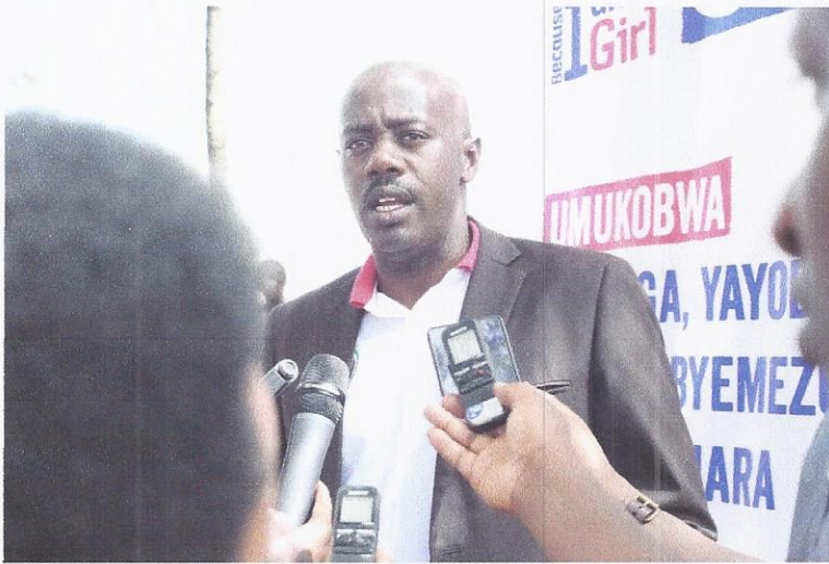
Ifoto 5: Umuyobozi w'Akarere ka Gatsibo (Umushyitsi mukuru mu birori)

Yagize ati: “Uyu muni turishimira ibintu binyuranye byakorewe umwana w’umukobwa n’umugore muri rusange, twavugaga nko kuba abagore bafite imyanya ingana na 64% mu nzego zifata ibyemezo.”