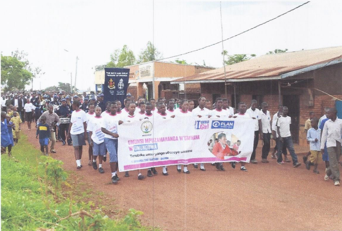
Ifoto1: Urugendo rugamije gukangurira abantu kubaka umuryango ubereye umwana

Ibirori byo kwizihiza umunsi Mpuzamahanga w'Umwana w'Umukobwa byatangijwe n'urugendo rugamije gukangurira abantu kubaka umuryango ubereye abana.