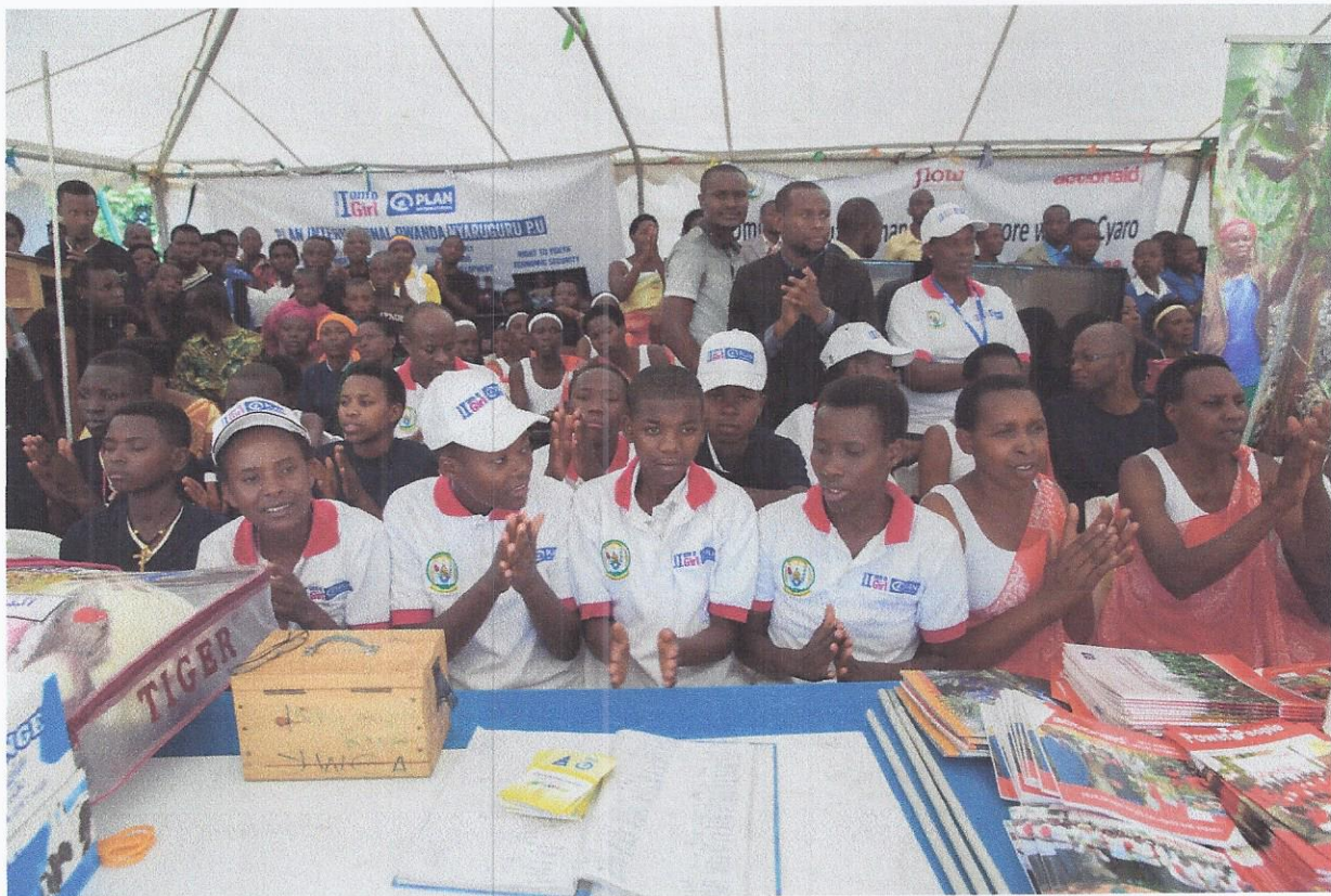
Ifoto 10: Abana b'abakobwa bagaragaza ibyo bamaze kugeraho

Nyuma yo gusoza ubutumwa yari yageneye uyu muni, umushyitsi mukuru n'abandi bayobozi bakuru basuye imurikabikorwa mu guteza imbere umwana w'umukobwa, umugore wo mu cyaro n'umuryango muri rusange.