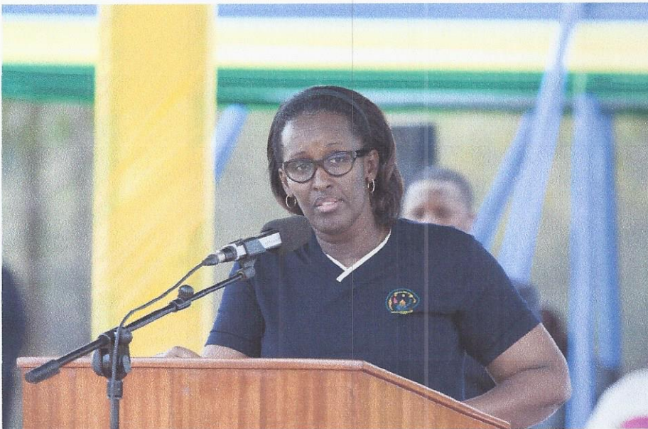
Ifoto 9: Madamu Jeannette KAGAME ageza ijamba ku bitabiriye ibirori

Madamu Jeannette KAGAME wari umushyitsi mukuru muri uyu muni yatanze ubutumwa bushingiye ku migani igira iti: "Umwana umuhera icyo wamubyariye ntumuhera icyo uzamukamirira". Arongera ati: "Utazi agakura abaga umutavu."