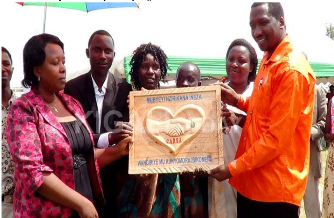
Abigishijwe bahanye impano z'urwibutso rw'ibyo bagezeho

Imiryango yahawe inka ni iy'abacitse ku icumu rya Jenoside yakorewe Abatutsi mu 1994 n'iy'ababiciye nyuma yo guhugurwa ku isanamitima n'ubwiyunge, aho imiryango ibiri yagiye ihabwa inka imwe yiswe Inka y'Ubwiyunge .