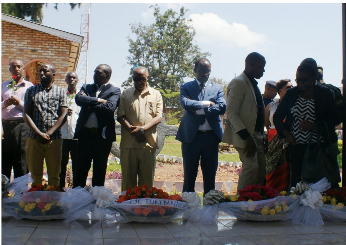
Umuhango wo gushyiraho indabo