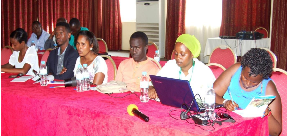
Abanyamakuru bitabiriye inama

Hifashishijwe urubuga rwa murandasi “internet” rwa Komisiyo arirwo www.nurc.gov.rw rwashyizweho mu gutangariza Abanyarwanda ibikorwa bya Komisiyo.