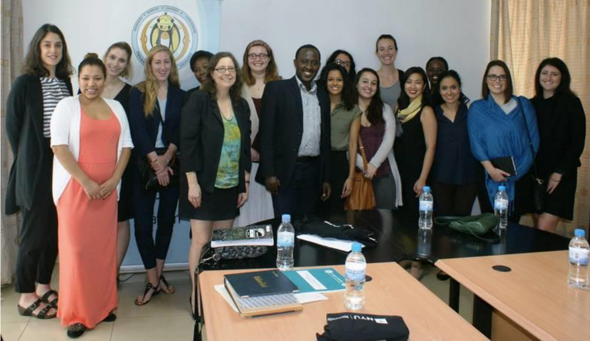
Ku itariki 15/01/2016, NURC yakiriye itsinda ry'abanyeshuri biga iby'Ubuyobozi, baje kwigira ku Rwanda ubutabera n'ubwiyunge