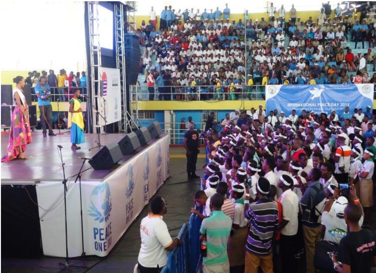
Igitaramo cy'amahoro (Peace Concert)

Buri muhanzi wese wamaraga kuririmba yavugaga icyo atekereza ku muni Mpuzamahanga w'Amahoro ndetse akagira n'ubutumwa agenera abari bateraniye aho. Dore bumwe mu butumwa abo bahanzi batanze burebana n'amahoro: