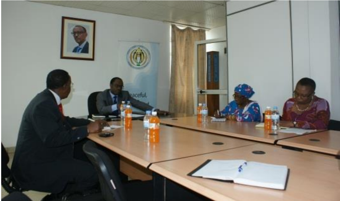
Abashyitsi baturutse Haut Commissariat à la Réconciliation et au Renforcement de l'unité National, Togo tariki ya 30/5/2015