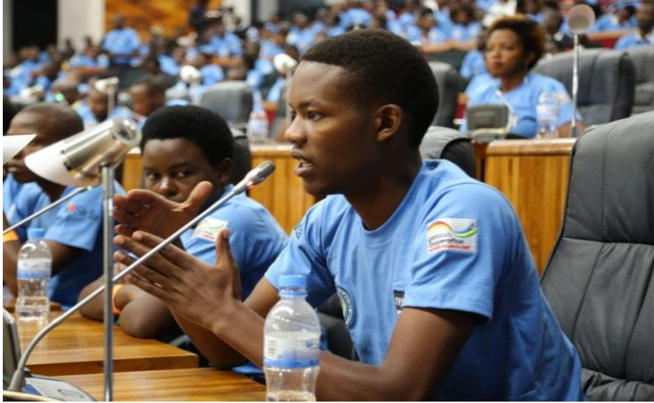
Urubyiruko rwitabiriye ibiganiro rwahawe umwanya rutanga ibitekerezo.

Mu ijamba Perezida wa Komisiyo y'Ubumwe bw'Abanyarwanda, Uburenganzira bwa Muntu no kurwanya Jenocide mu Nteko Ishinga Amategeko y'u Rwanda, Hon. BYABARUMWANZI François yavuze asoza ibi biganiro yashimiye ababyitabiriye, abibutsa guhora bazirikana ko intambara itangirira mu mitima y'abantu ikaba ari naho irangirira ko rero ari byiza kurandura intambara mu mitima ahubwo hakimakazwa amahoro mu mutima wa buri wese.