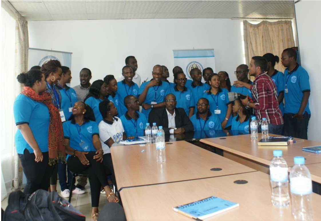
Urubyiruko ruturutse mu bihugu bitandukanye by' Afurika basuye NURC tariki ya 5/1/2016