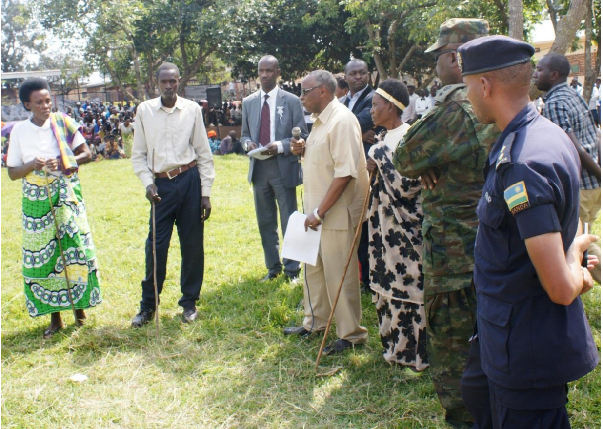
Perezida wa Komisiyo mu gikorwa cyo kumurika inka n'abazihabwa

Mu butumwa bwahatangiwe, hibukijwe ko tugomba “ Kwibuka turwanya ingengabitekerezo ya Jenocide. ” Kandi ko ingengabitekerezo ya Jenocide ari ikiyobyabwenge tugomba kuyirwanya twivuye inyuma, twamagana abayihembera, ikaranduranwa n'imizizi yayo.