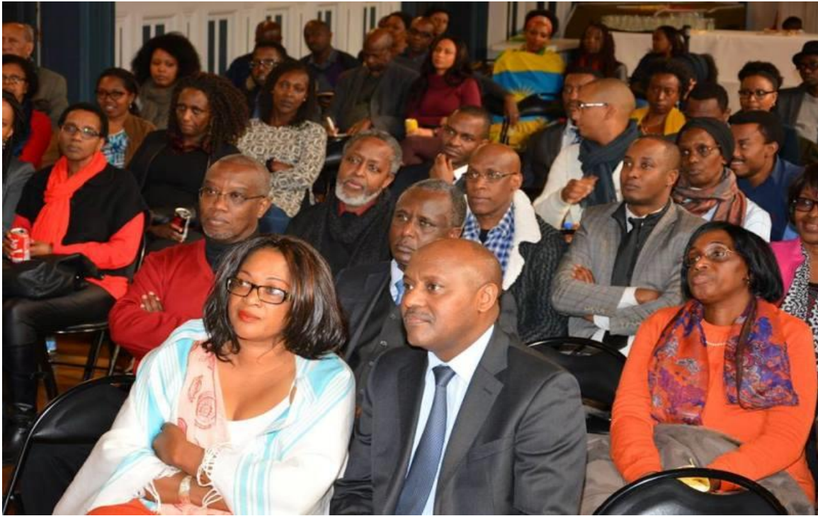
Bamwe mu bitabiriyi ibiganiro mu mujyi wa Paris

Mu biganiro byatanzwe, izo ntumwa zibanze cyane ku bintu by'ingenzi byari byubatswe u Rwanda n'Abanyarwanda mbere y'umwaduko w'Abakoloni. Ko ibyo byaje kugira ingaruka mbi nyinshi mu mateka mabi yaranze Repubulika ya mbere n'iya kabiri, biza no kugera kuri Jenoside yakorewe Abatutsi muri 1994 n'ingaruka zayo.