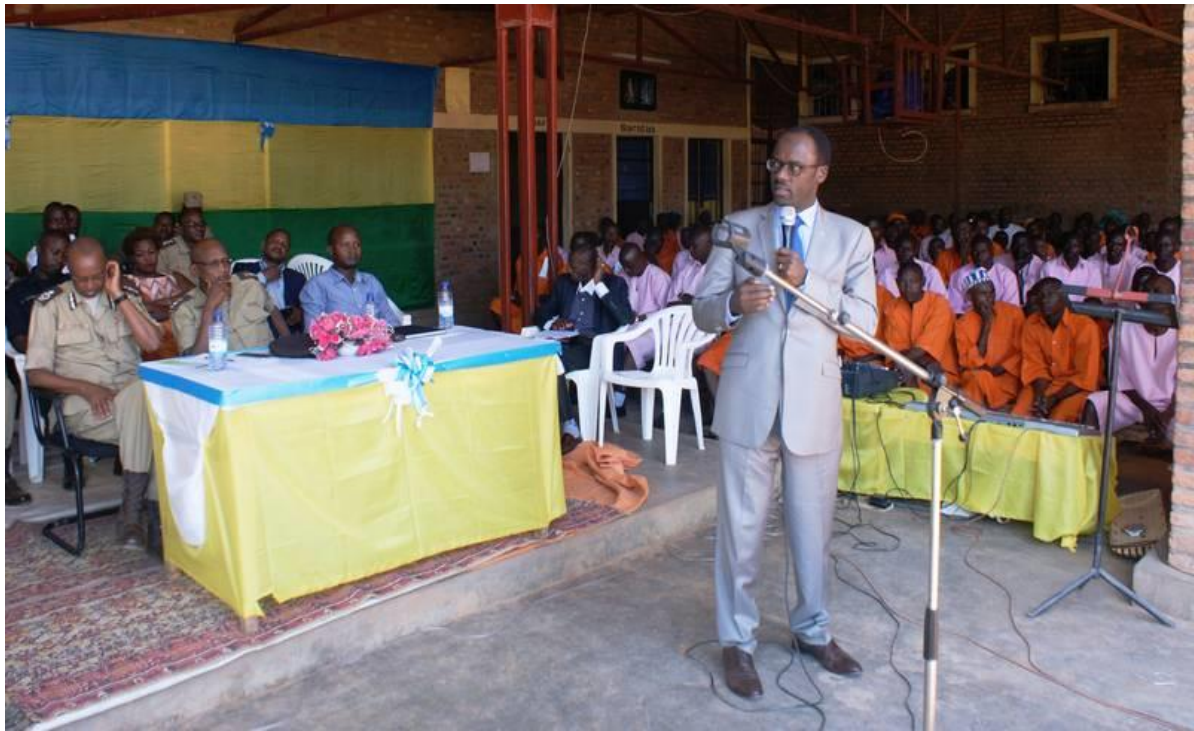
Umunyamabanga Nshingwabikorwa wa NURC abagezaho ubutumwa