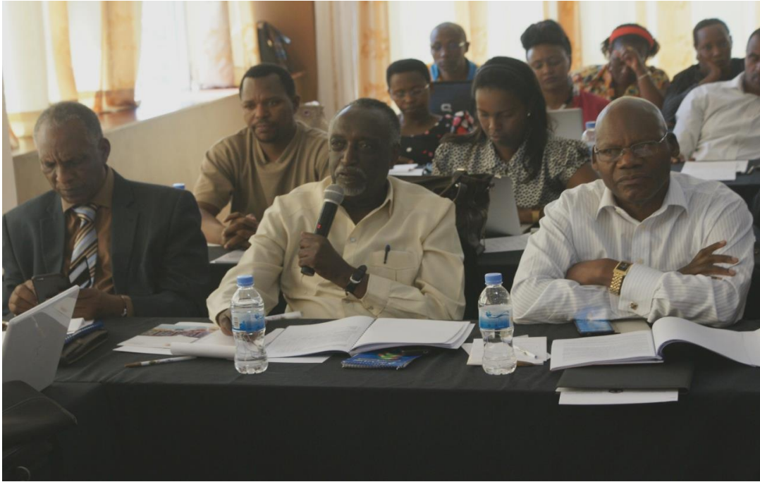
Bamwe mu bitabiriyi inama nyunguranabitekerezo ya RRB 2015