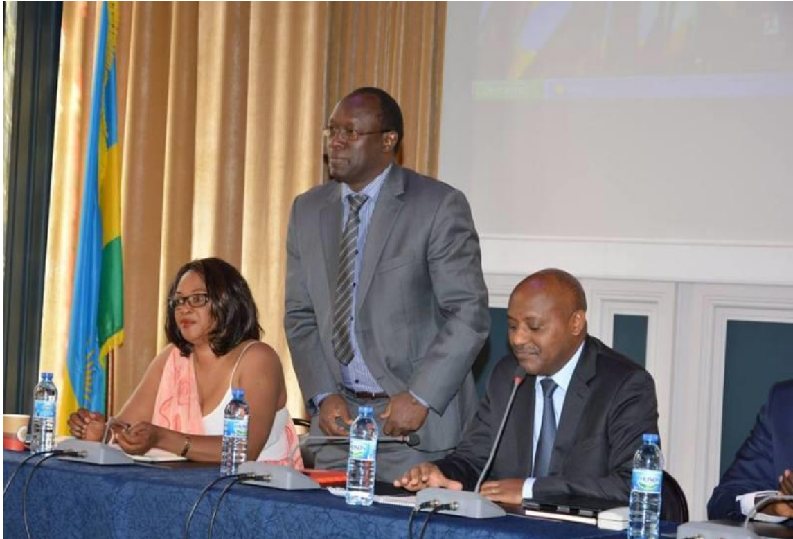
Komiseri Padiri Consolateur ari mu biganiro mu Bufaransa

Itsinda ry'intumwa z'u Rwanda zirimo Umukomiseri muri Komisiyo y'Igihugu y'Ubumwe n'Ubwiyunge n'Abadepite mu Nteko Ishinga Amategeko bakoreye urugendo rw'akazi mu gihugu cy'Ubufaransa kuva ku itariki ya 03 Werurwe kugeza ku wa 07 Werurwe 2016, bagirana ibiganiro kuri Ndi Umunyarwanda mu Mujyi wa Paris byitabirwa n'Abanyarwanda n'inshuti z' u Rwanda bagera kuri 160, tariki ya 06 Werurwe, ibyo biganiro bikomereza mu Mujyi wa Lyon byitabirwa n'abasaga 100.