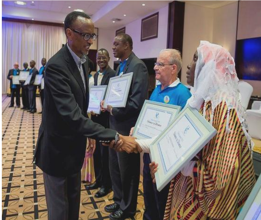
Perezida wa Repubulika Paul KAGAME ashimira Abarinzi b'Igihango

Igikorwa cyo kumurika no kwizihiza Abarinzi b'Igihango ku rwego rw'Igihugu cyayobowe na Madamu wa Nyakubahwa Perezida wa Repubulika Jeannette KAGAME Umuyobozi Mukuru wa Unity Club mu ihuriro ryayo rya 8. Ku ikubitiro, hamuritswe 17 ku rwego rw'Igihugu.