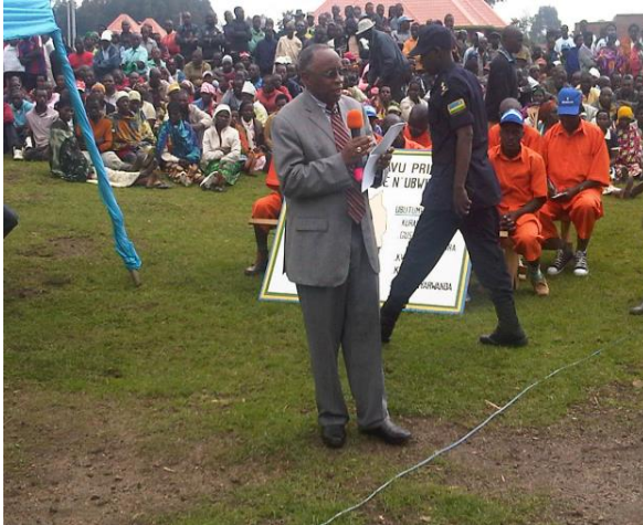
Icyumweru cy'ubumwe n'ubwiyunge mu Murenge wa Kanzenze

Muri rusange ubutumwa bwatanzwe bwerekezaga ku kubumbatira ubumwe no kugira urukundo hagati y'Abanyarwanda.