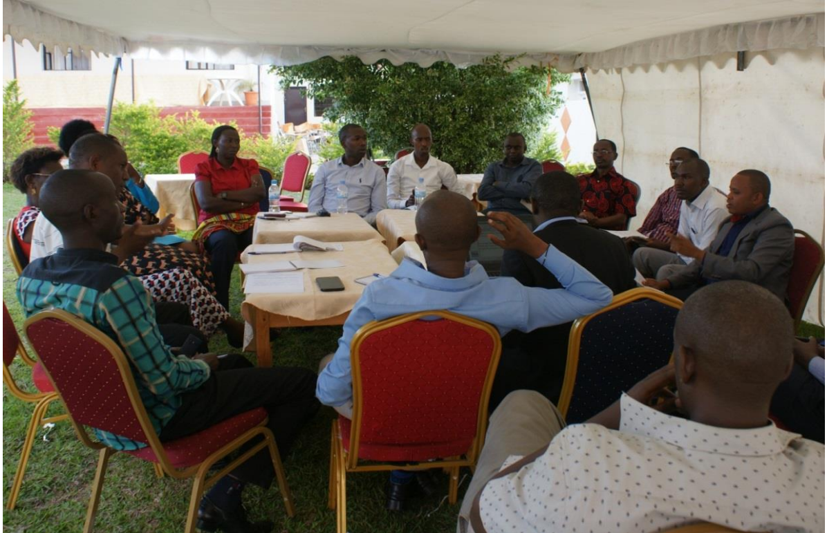
Ibiganiro mu matsinda