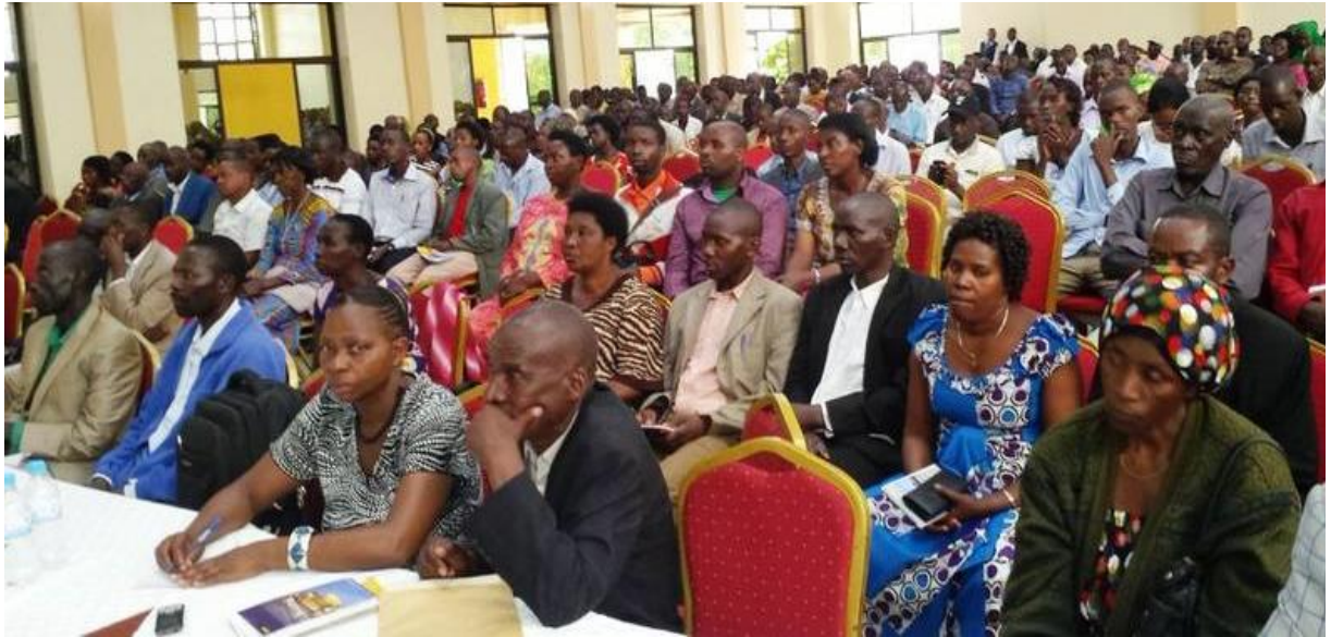
Abakangurambaga b'Ubumwe n'Ubwiyunge bakurikiye ikiganiro