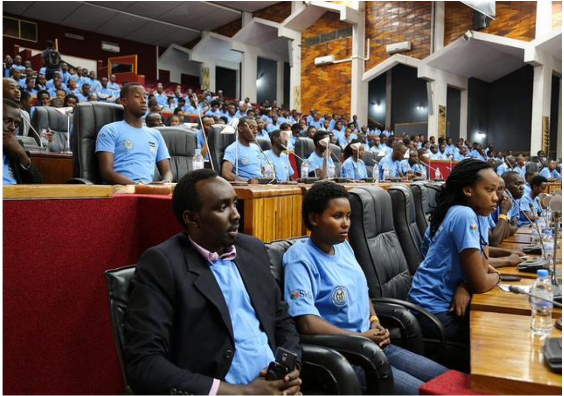
Inama yahuje urubyiruko n'abagize Inteko Ishinga Amategeko