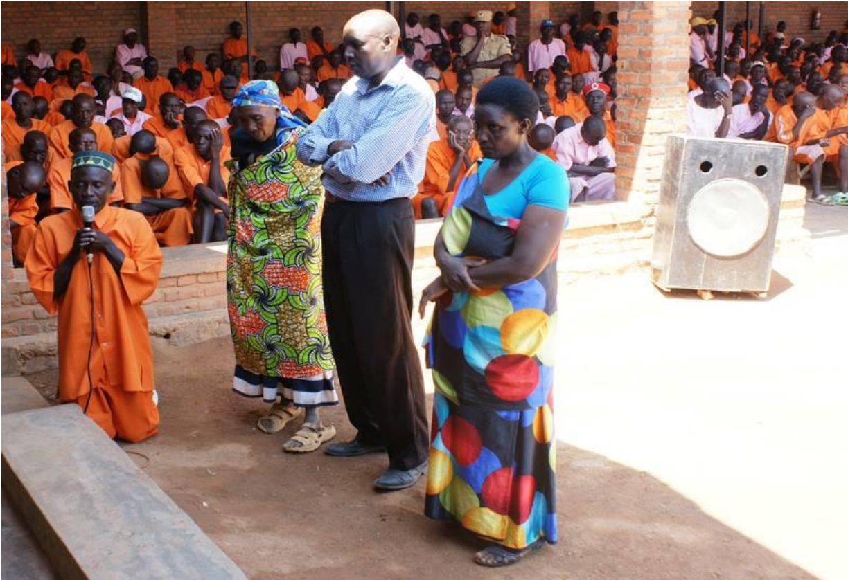
Abagororwa 30 bo muri Gereza ya Bugesera basaba imbabazi ku mugaragaro abarokotse Jenoside yakorewe Abatutsi