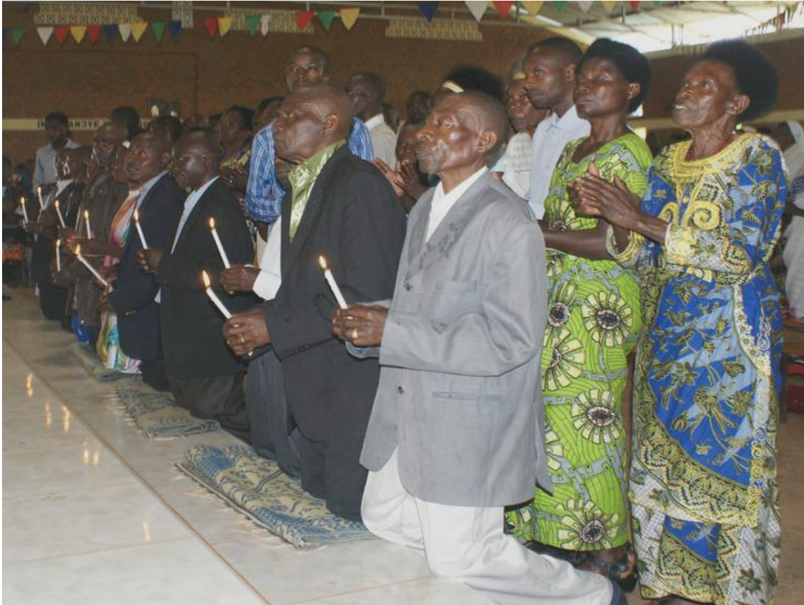
Abagarukiramana bakomorewe amasakaramentu muri Paruwasi ya Ntendezi tariki ya 01/05/2016

Kubera uruhare rukomeye gahunda y'isanamitima ifite mu rugendo rwo komorana ibikomere, kwigaruramo ubumuntu, kvanaho urwikekwe no kutishishanya hagati y'abishe n'abiciwe ababo, Paruwasi Gatorika ya NTENDEZI ikaba yarabashyiriyeho gahunda y'inyigisho n'ibiganiro bitangwa mu gihe cy'amezi 6 nk'uburyo bunoze bwo kubafasha gusaba no gutanga imbabazi babivanye ku mutima.