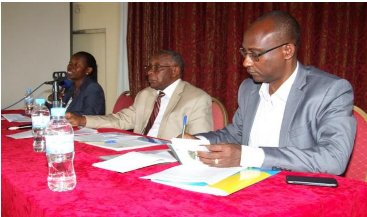
Abayobozi basobanurira ibikorwa bya Komisiyo itangazamakuru

Mu rwego rwo kugira ngo ibikorwa bya Komisiyo bigere ku Banyarwanda benshi bashoboka, kuwa 03 Ugushyamba 2016 muri Hotel Umubano habaye ikiganiro n'Abanyamakuru cyayobowe na NURC ifatanyije n'Umuryango Unity club Intwararumuri, aho basobanuriye itangazamakuru rikoresha radiyo, televiziyo, iryandika n'irikoresha imbuga za internet gahunda z'Icyumweru cy'Ubumwe n'Ubwiyunge, igikorwa cyo gutoranya Abarinzi b'Igihango n'ihuriro rya munani ry'Umuryango Unity club Intwararumuri, kugira ngo bazitangarize Abanyarwanda b'ingeri zose.