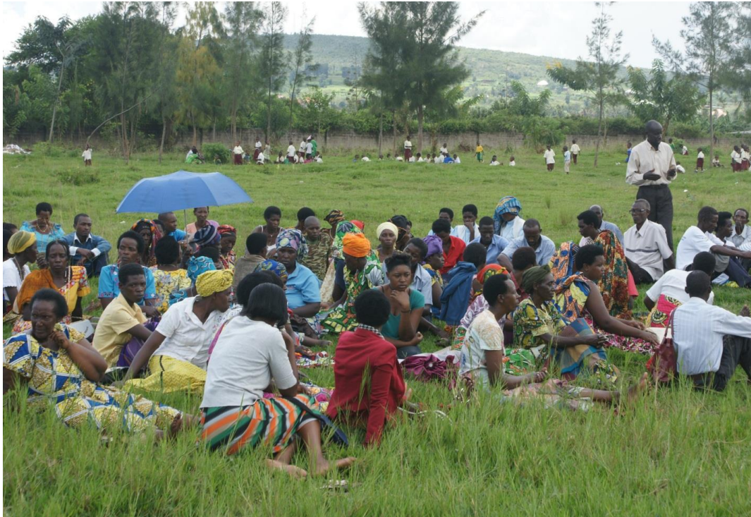
Abacitse ku icumu baganira mu itsinda i Nyamata

Mu matsinda, abacitse ku icumu rya Jenocide yakorewe Abatutsi barisanzuye bagaragaza intimba baterwa no kubona bamwe mu babiciye bireze bakemera icyaha, baragarutse mu buzima busanzwe bakaba bakora imirimo y'ubuyobozi n'izindi service mu kiriziya mu gihe batigeze basaba imbabazi abo bahemukiye.