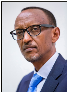
Nyakubahwa KAGAME Paul, Perezida wa Repubulika y'u Rwanda

“Ntidushobora gusubiza igihe inyuma cyangwa ngo tuvaneho ibibi byatubayeho ariko dufite ubushobozi bwo kugena ejo heza hazaza h’u Rwanda no gutuma ibyabaye bitazongera kuba ukundi...”